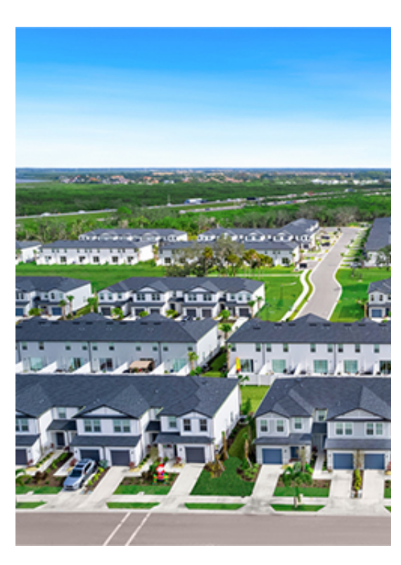
Cantabria Bradenton spans 184 three- and

Acquisitions Build-to-Rent Florida Multifa